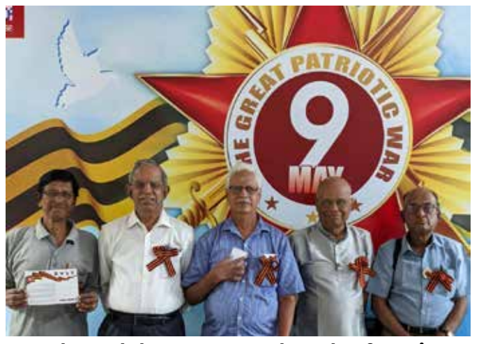
Probus Club represented at the function held on 09 May 2022 at the Russian Centre